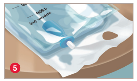
Lay the catheter on the opened package, so the tip is positioned over the paper, taking care not to contaminate the catheter tip.